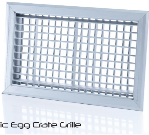
Plastic Egg Crate Grille